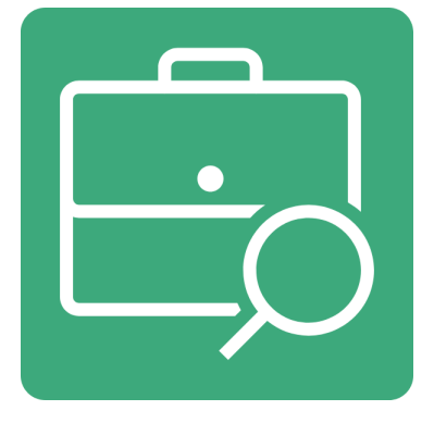
Browse the Training Archive